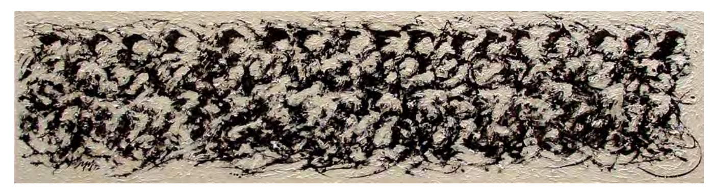
BOTAK Acrylic on canvas 50.8 x 203.2 cm / 20 x 80 in 2012

From the perspective of art history in the Philippines, Montemayor converses with the important attempts of his fellow observers of Manila to depict the state of the city under varying historical circumstances. Vicente Manansala's evocation of the shanty would lead him to a distinct visual language of a belated cubism, crafted in tension with the morphology of Manila's architecture amid the ruins of war in which the barongbarong surfaces as a trope of post-colonial appropriation and "productive mistranslation." His conjuration of the queues for rice in the city is a piercing insight into the scarcity that seizes the urban vicinity, which has been envisioned by planners and potentates as an artifact of the future. Danilo Dalena's acute instinct to discern the proximity of bodies within a devotional context goes beyond the description of a heady moment; it prompts us to consider an aesthetic situation where image and body mingle and the artist participates in the gesture of representing both the object of reality and the affect that it generates. Antonio Austria's intimate portraits of people in their humble milieu are sorties into another form of survival and prevailing in the city. As they intuit the sensibility of homespun environments so do they summon a particular manner of fleshing out their felicitous details in paint by way of a certain composition and mode of figuration that relate to the aesthetic dispositions for ornament.