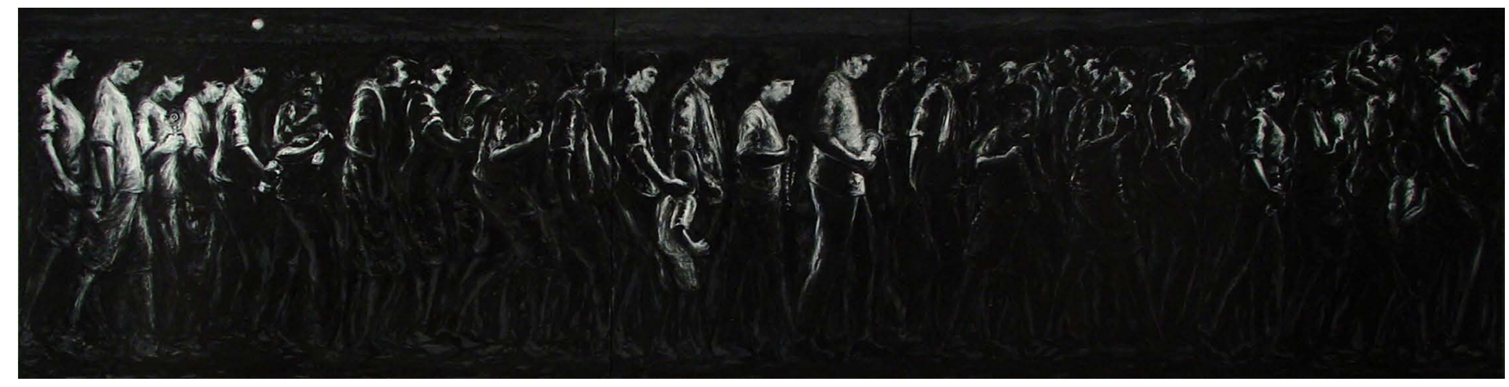
ALAY LAKAD Acrylic on canvas 152.4 x 609.6 cm / 60 x 240 in (Polyptych) 2012