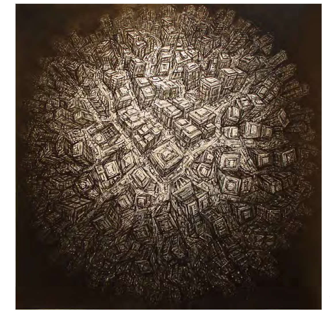
RUSH HOUR Acrylic on canvas 200.7 x 200.7 cm / 79 x 79 in 2012

In the end, in Montemayor's vista, it is the body – finite, persevering, violated, inspired – that stirs up the force, the liveliness, the agency of the city. In what may well be a homage to the futurist impulse of simulating celerity, he keenly invests in the semblance of passage, of transport, of acceleration, of shift, of restless turning. Within this frenzy, there is also entropy and inertia, however, as the city may also grind to a halt, exhausted, worn out, gasping for breath. Around this sense of unnerving as well as enervation are people, inhabitants, communities who form the greater image of the city and its contemporary life, they who have come to terms with a modus vivendi, a social contract of living together for better or for worse. They are the bodies who coalesce and disperse, who eke out a life, who work on the destruction of shelter and who salvage its remains. They are going through the motions of redeeming themselves in the fallout of modernities that continue to promise and continue to fail. Output Description: